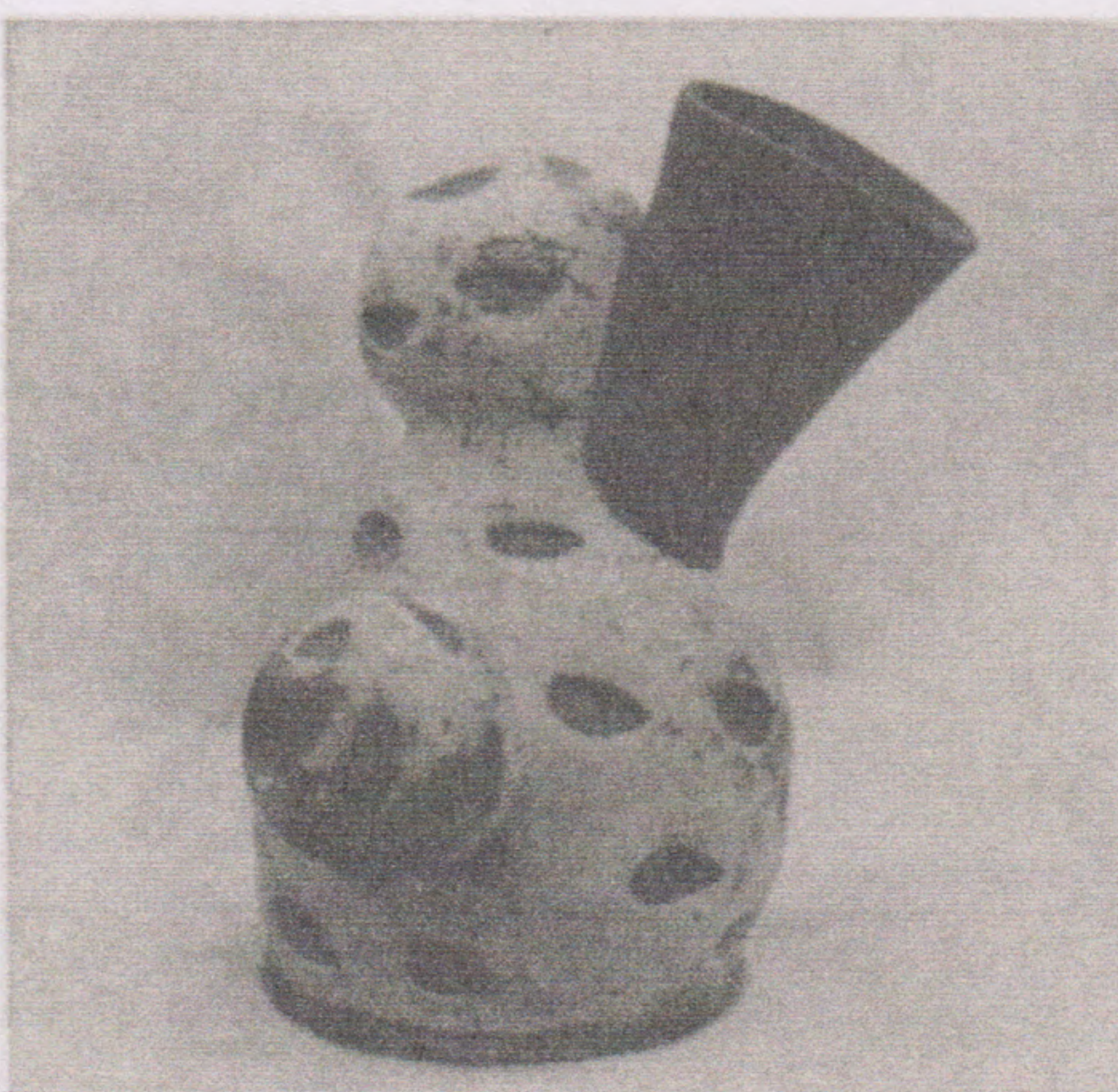
Fig. 2. Mochica vessel (about A.D. 400) portraying a special brand of dehydrated potato known as tunta, a product that is still manufactured in the Peruvian highlands today. Tunta is a stream-washed, or more purified version of another dehydrated form of the potato known as chuño. Both tunta and the darker colored chuño may be kept in storage almost indefinitely.

The origin of the diploid species S. sparsipilum is a case in point. The