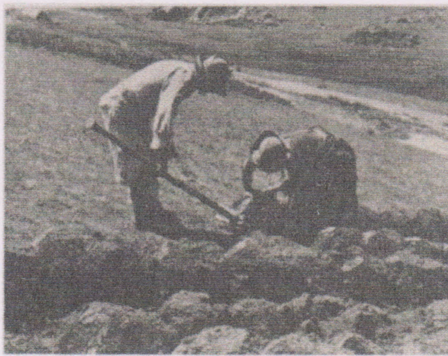
Fig. 1. Quechua Indians using the foot-plow, or "tacla," an instrument used to turn the soil in preparation for planting potatoes. Ceramic models of the footplow are known from the Chimu period (about A.D. 800).

primitive cultigen restricted to the Andes of South America, whereas the second ( S. sparsipilum ) is an aggressive weed that occurs naturally in the cultivated potato fields of Peru and Bolivia. Although the two putative ancestral species put forth by Hawkes do appear to be reasonable choices, and, in fact, are very likely to have been involved in the production of allotetraploids, it is difficult to believe that other diploid taxa, as well as other mechanisms of speciation other than that of amphidiploidy, were not indirectly (if not directly) very much a part of the overall cycle of potato evolution which led ultimately to the appearance of the cultivated tetraploids.