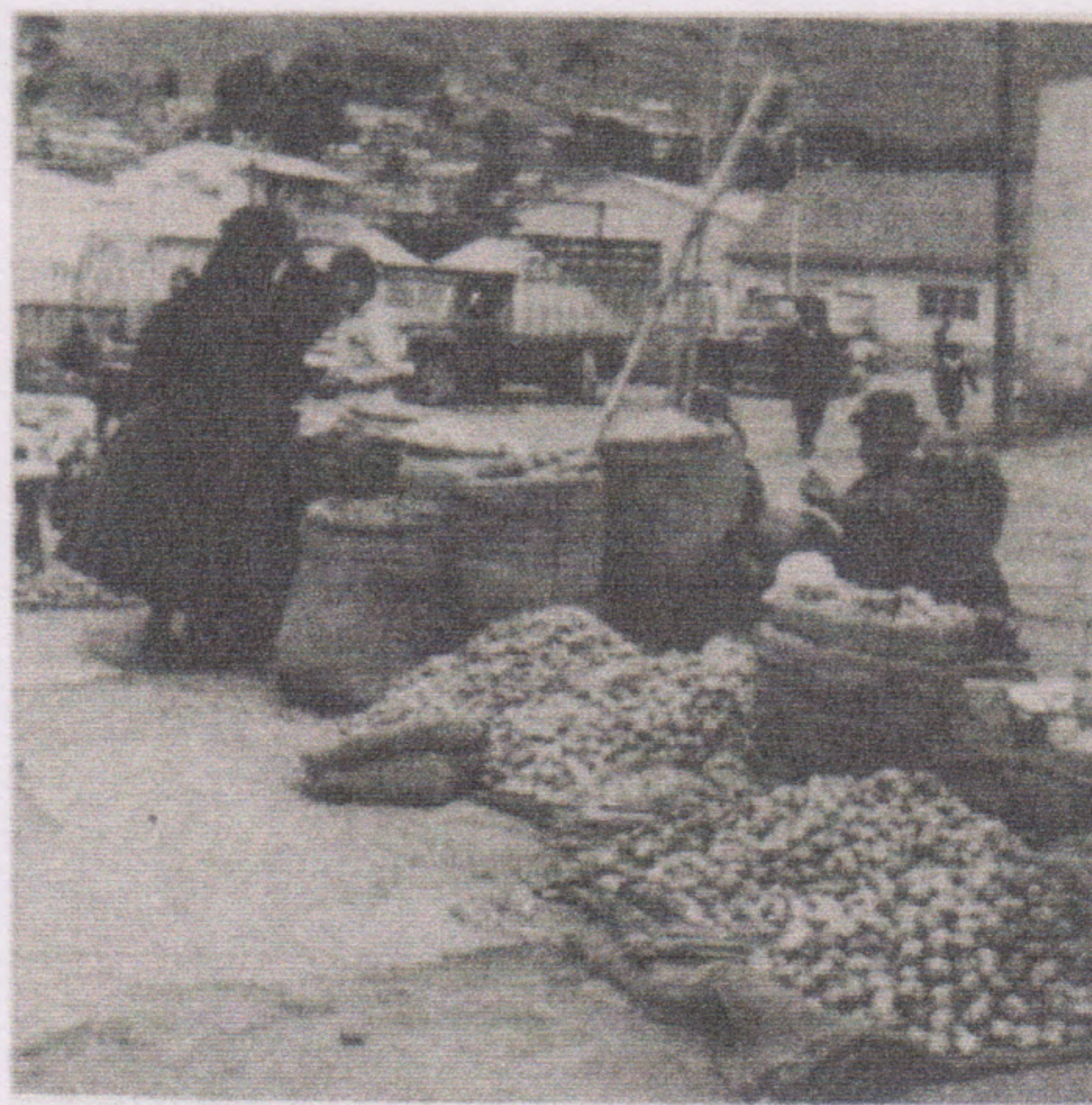
Fig. 3. A market vendor in Puno, Peru. Potatoes of many different sizes, shapes, skin colors, textures, cooking properties, and flavors are sold in the native market places of southern Peru. All three chromosomal groups of S. tuberosum may be represented within a single market pile of Andean potatoes. However, cytological study is frequently the only means by which these may be told apart.

Ancestral to all the modern cultivars of the potato, the primitive S. tuberosum group Stenotomum cultivars have regularly occupied the attention of potato specialists from the time of their announced discovery by Russian cytologist V. A. Rybin in the mid 1920's [the report of which was officially published in 1929 (18)]. After Rybin's announcement, cytological and taxonomic studies of the diploid cultivars were taken up or continued in many different regions of the globe, and from these investigations, truly international in scope, a picture is beginning to emerge of the evolution of the potato under domestication.